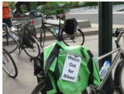
Ride of Silence